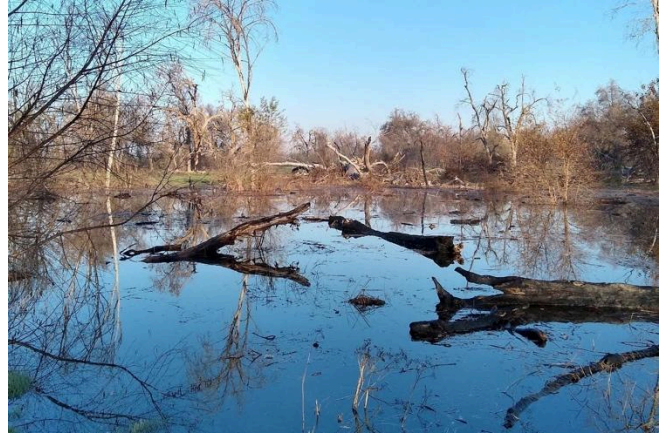
Groundwater recharge project at Kaweah Oaks Preserve.

The outreach process is designed to build a better understanding of the challenges disadvantaged communities face and identify opportunities for this program to help address them. This program will also provide disadvantaged communities in the Kaweah subbasin resources to learn about land repurposing and groundwater sustainability, as well as water and air quality issues in the region.